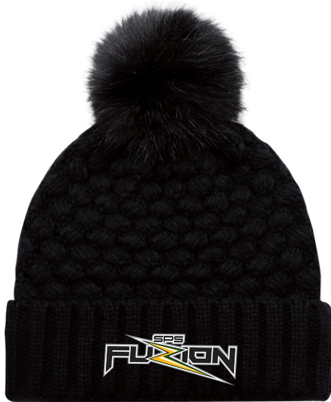
Bubble Knit w/ Faux Fur Pom