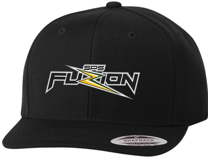
Yupoong Classic Snapback