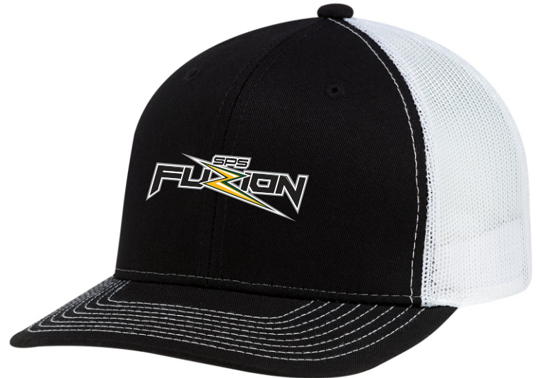
Yupoong Retro Trucker